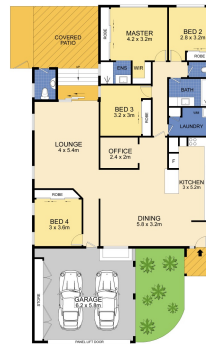
13 CENTENARY CRES MAROOCHYDORE INTERNAL AREA - 141 SQM LIVING AREA - 20 SQM EXTENSIVE PATIO - 20 SQM TOTAL AREA - 201 SQM