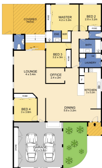
13 CENTENARY CRES MAROOCHYDORE INTERNAL AREA - 141 SQM LIVING AREA - 20 SQM EXTENSIVE PATIO - 20 SQM TOTAL AREA - 201 SQM