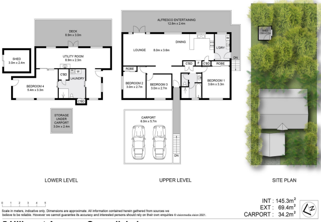
5 Hillcrest Avenue, Goonellabah