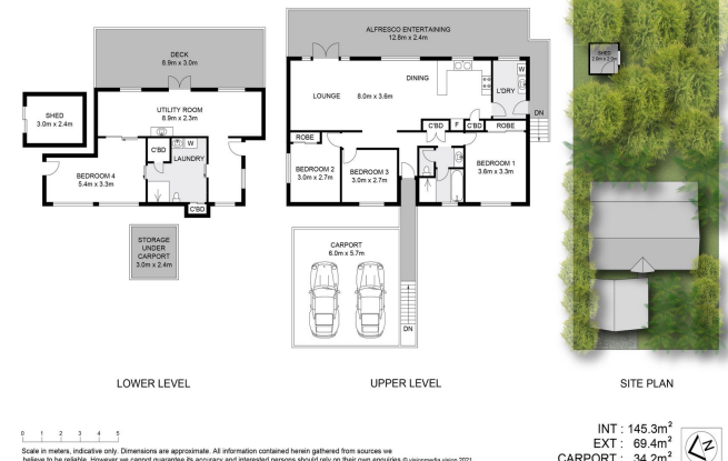
5 Hillcrest Avenue, Goonellabah