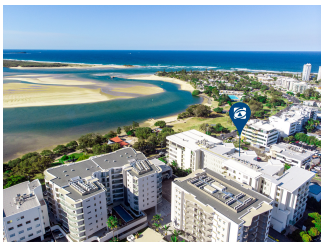
Unit 509 Space - The Residences, 45 The Esplanade Cotton Tree