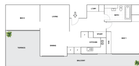
Unit 509 Space - The Residences, 45 The Esplanade Cotton Tree

As per the floor plan, the floor plan is for information only. The floor plan is not a contract and does not constitute an offer. The floor plan is not a contract and does not constitute an offer. The floor plan is not a contract and does not constitute an offer.