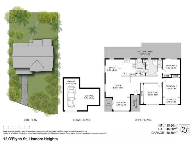
12 O'Flynn St, Lismore Heights